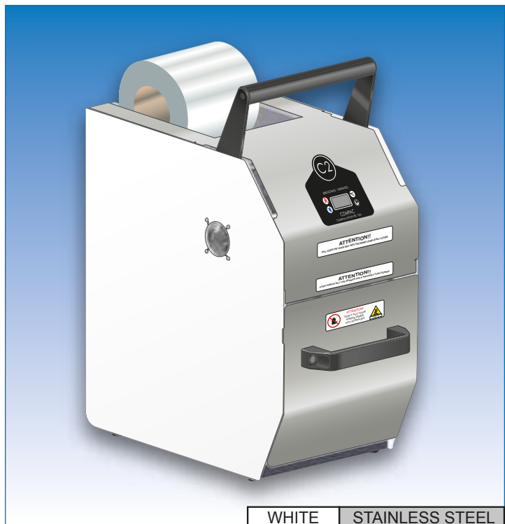
WHITE | STAINLESS STEEL

Table Top Heat Sealing Machine. Digital control panel with a setting of temperature and time sealing. Multi format. Possibility to seal 5 different formats without changing the mold: