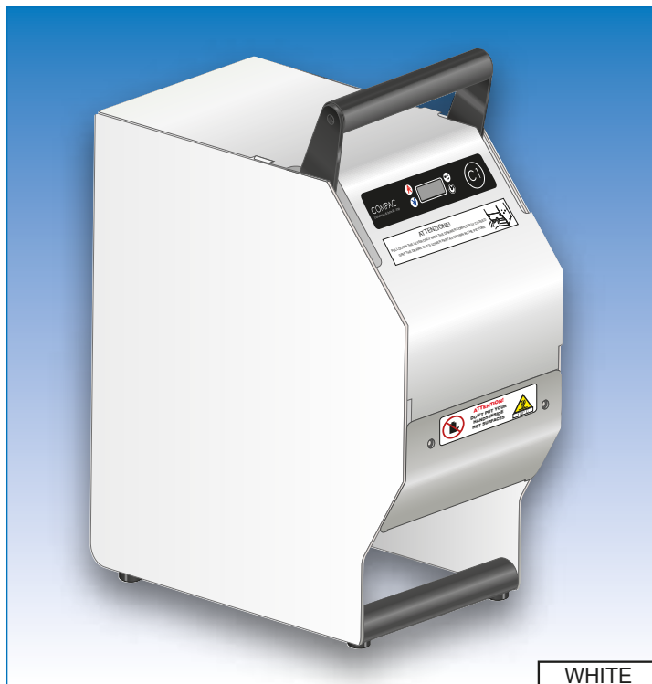
Table Top Heat Sealing Machine. Digital control panel with a setting of temperature and time sealing. Multi format. Possibility to seal 3 different formats without changing the mold: