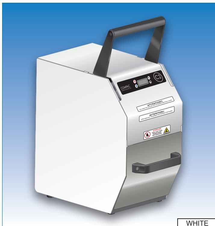
Table Top Heat Sealing Machine. Digital control panel with a setting of temperature and time sealing. Multi format. Possibility to seal 5 different formats without changing the mold:

P1 – 137 x 95 mm L – 230 x 190 mm P2 – 137 x 120 mm M – 260 x 190 mm G – 190 x 137 mm